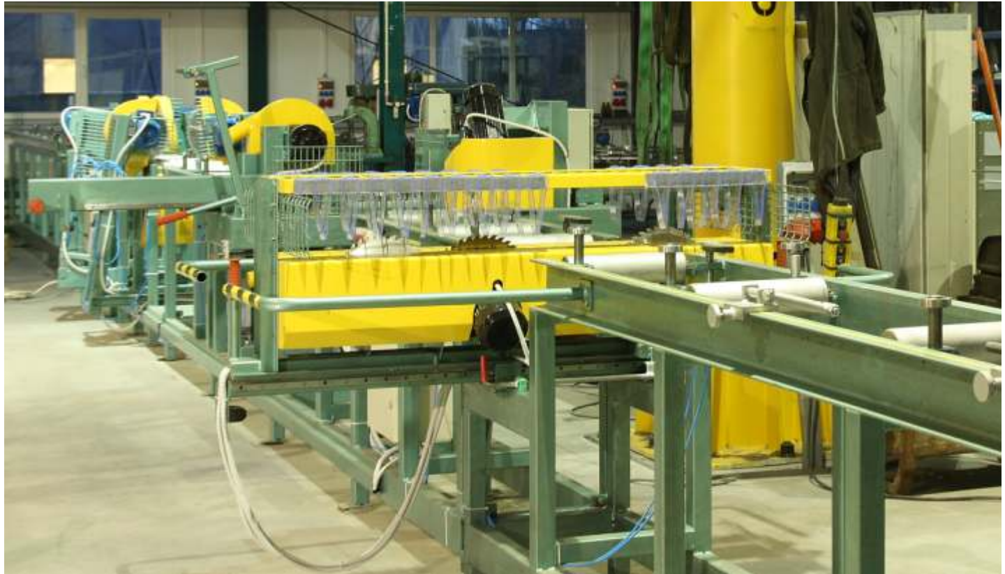
„Dovetail” notch line

The line is designed to make dovetail notches. All notches are made with circular saws which guarantees very high quality and precision of cuts. The line forms a necessary part of equipment for production of log houses.