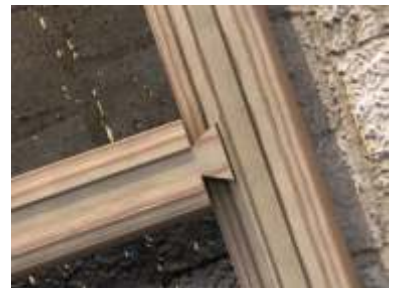
Connection of external wall with internal wall with use of half-interlocking dovetail.