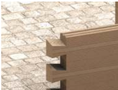
Log dovetail notch without remains