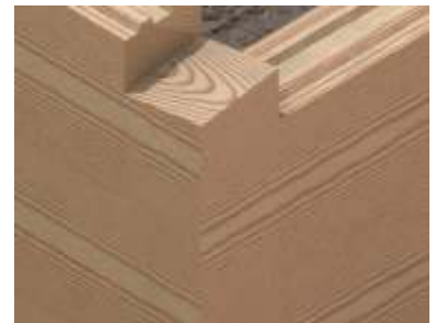
Corner of an external wall with a dovetail interlocking corner without remains.