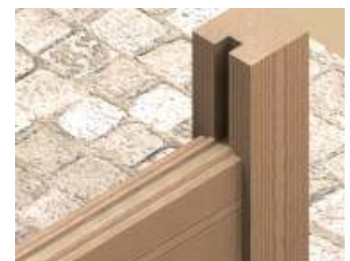
Pole-beam connection protecting the doors and windows from building settlement.