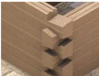
Log dovetail notch with remains